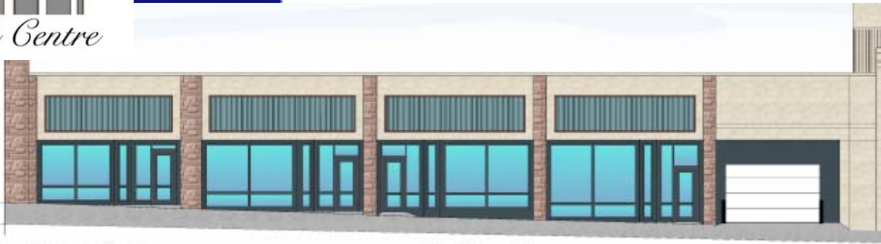
Security National Bank